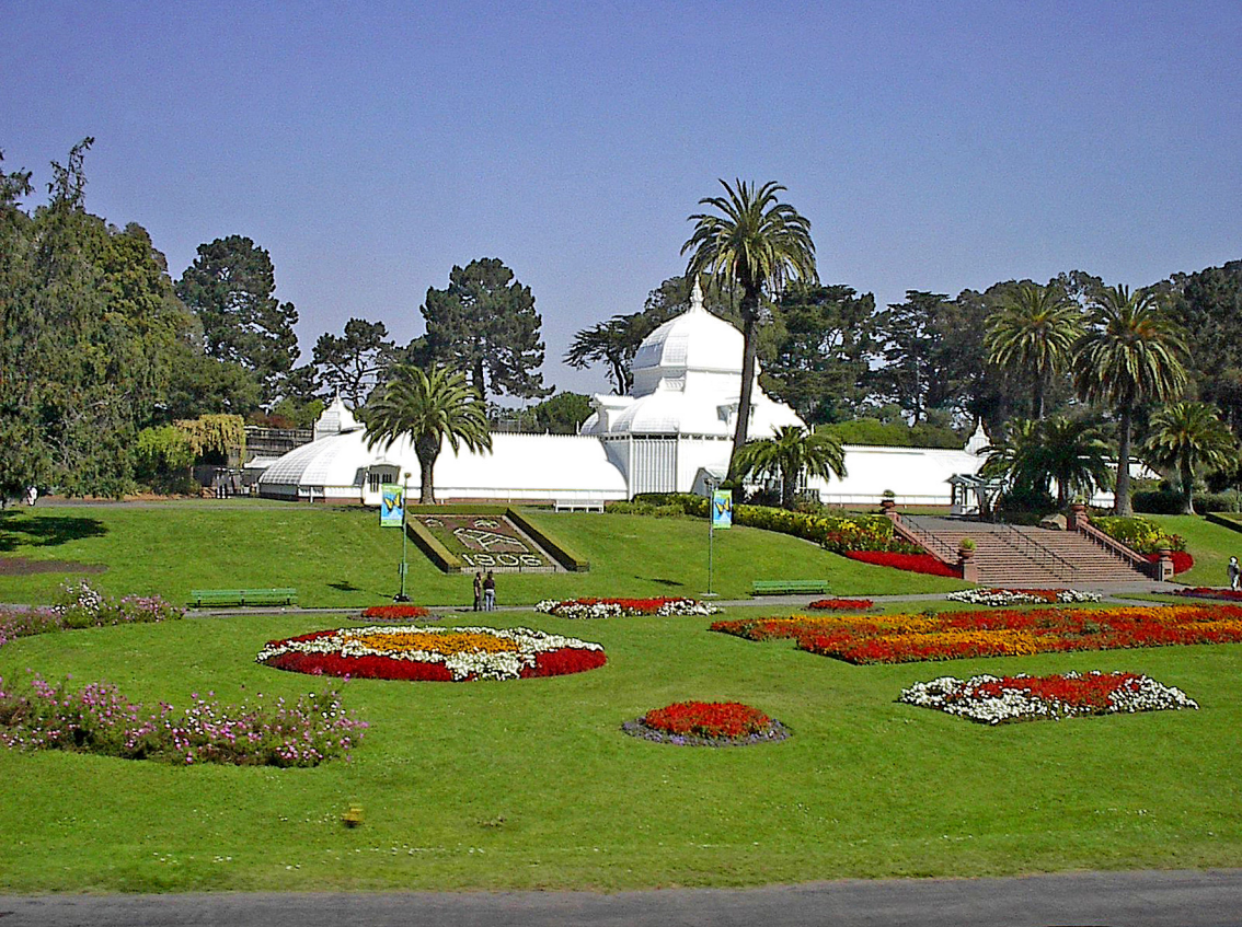
San Francisco - der wunderschöne Golden Gate Park