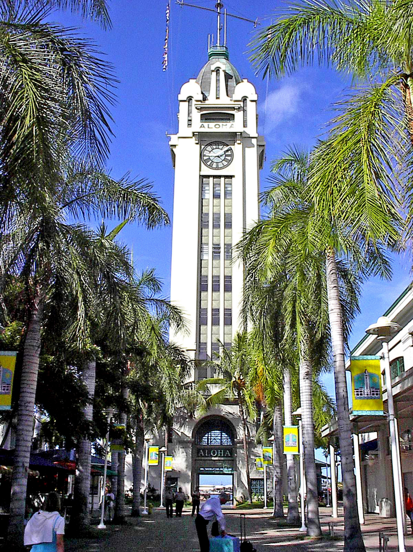
Oahu - Honolulu