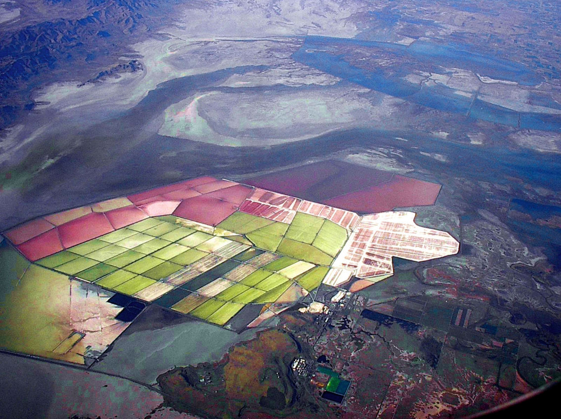
In den Bergtälern bewässerte Felder