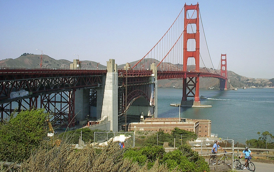
San Francisco - und dazu gehört das Bild der Golden Gate Bridge