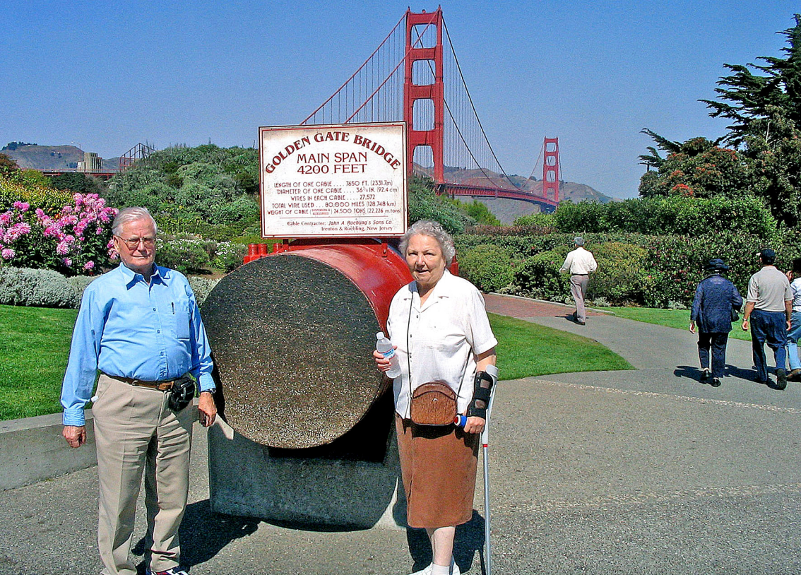
San Francisco - die technische Seite der Golden Gate Bridge