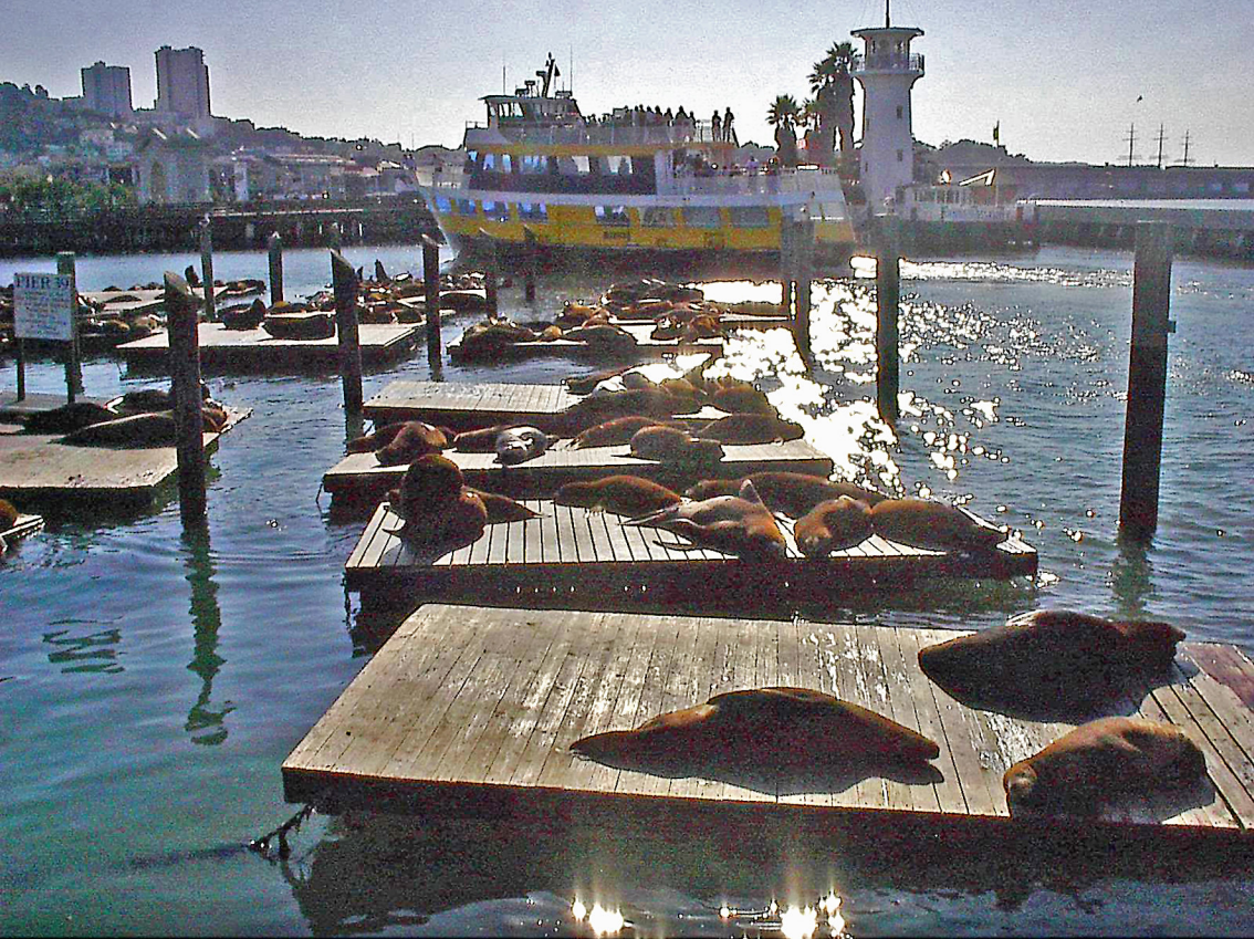
San Francisco - am Pier 39