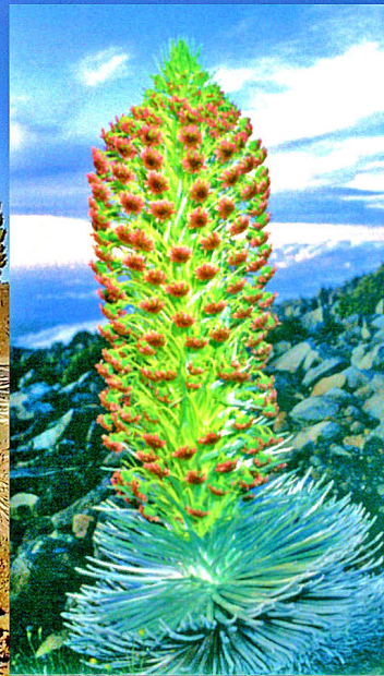
Maui - Pu'u'u'ula Summit mit dem geschützten Silverswort