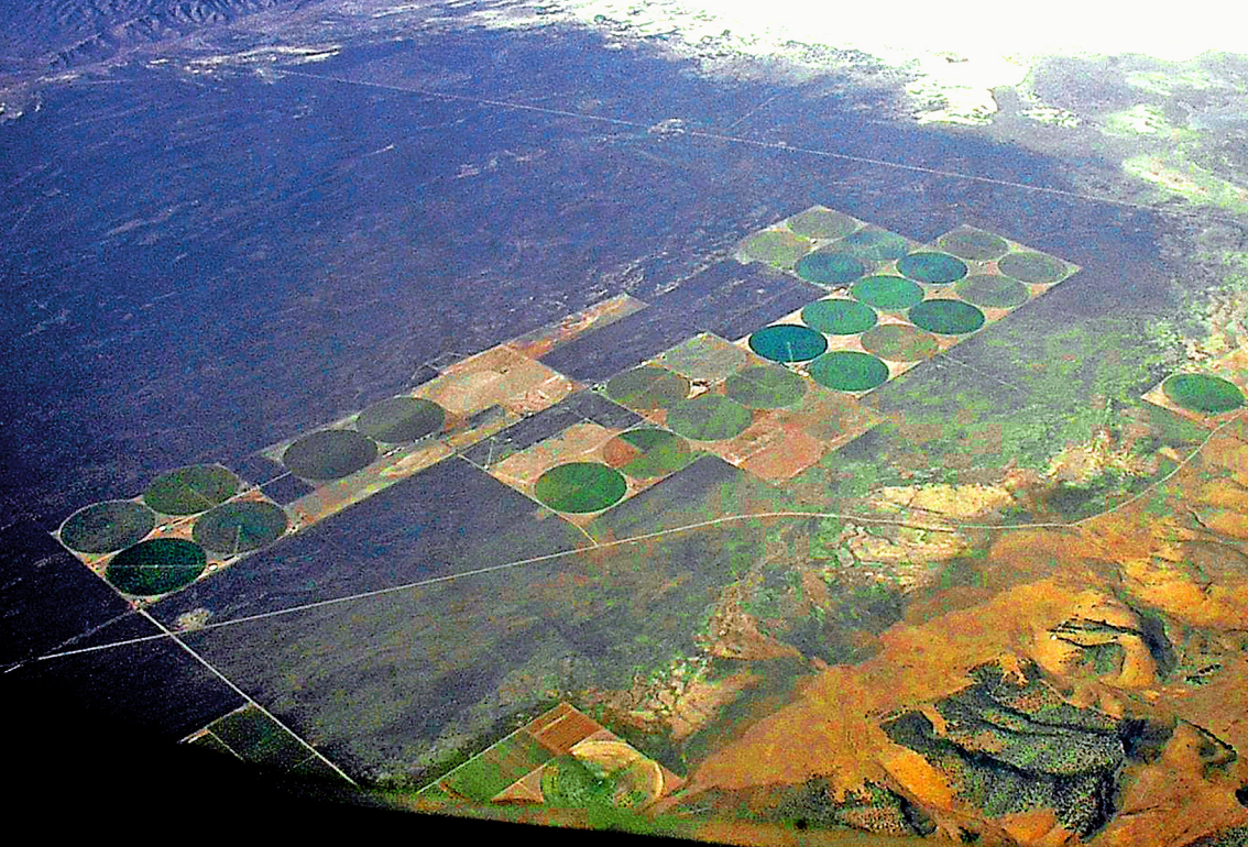
In den Bergtälern im ,central pivot irrigations'-Verfahren bewässerte Felder