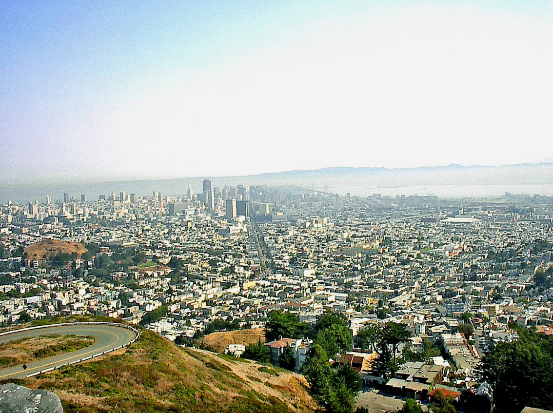
San Francisco - Blick von den Twin Peaks , auf die Market Street