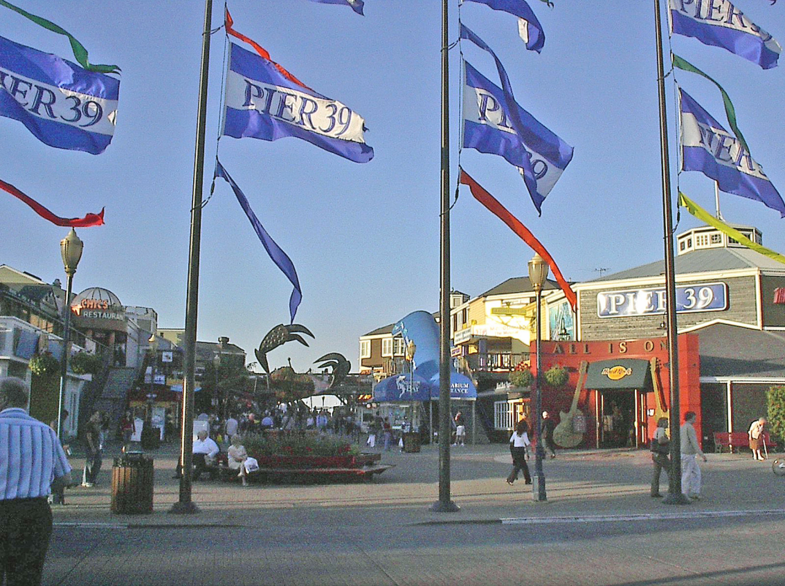
San Francisco - Pier 39