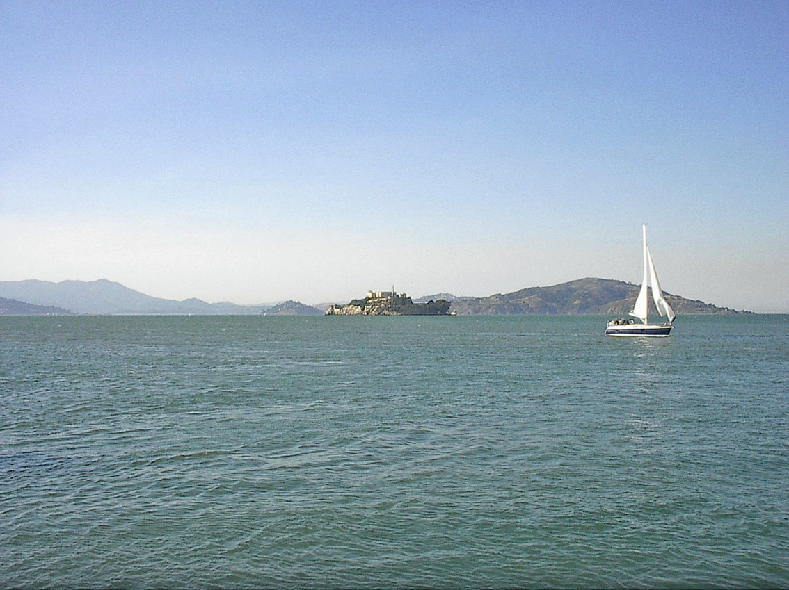
San Francisco - Alkatraz