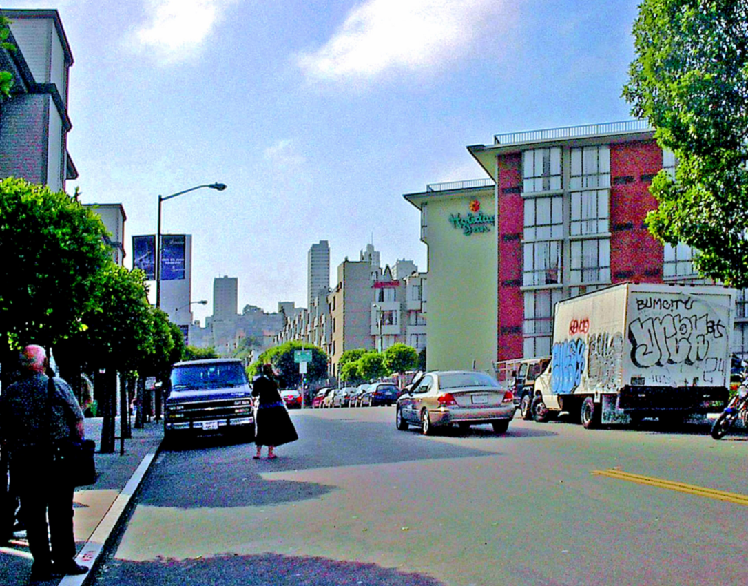
San Francisco - das Holiday Inn, unser Hotel in guter Lage