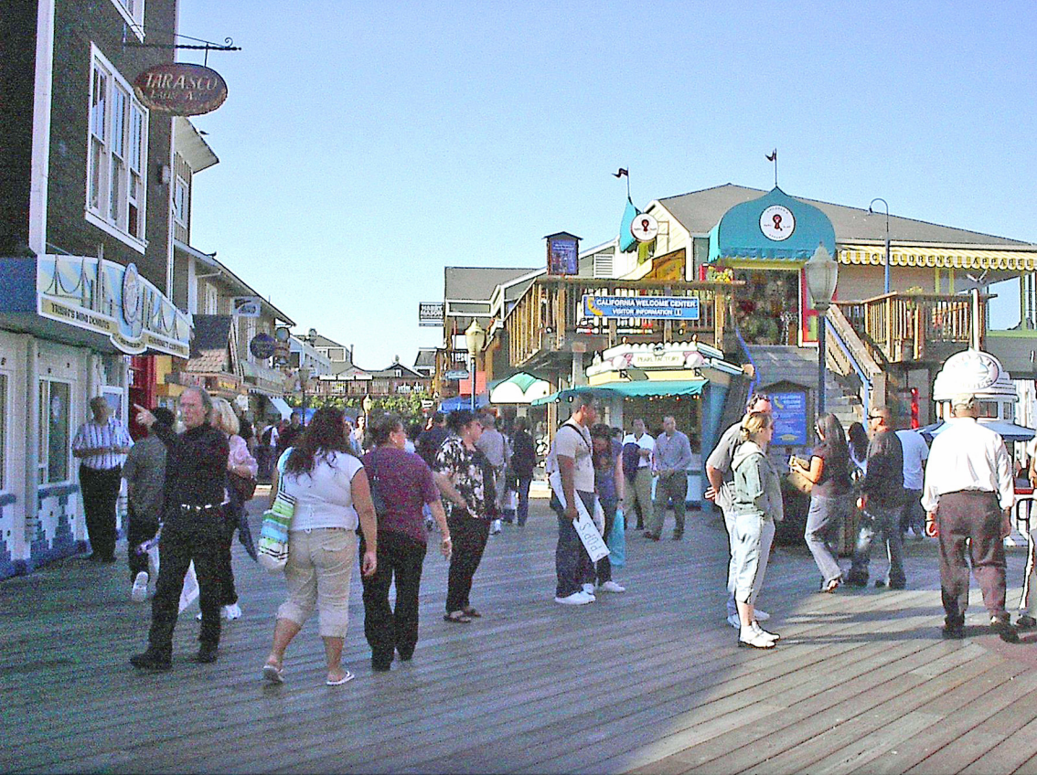
San Francisco - am Pier 39