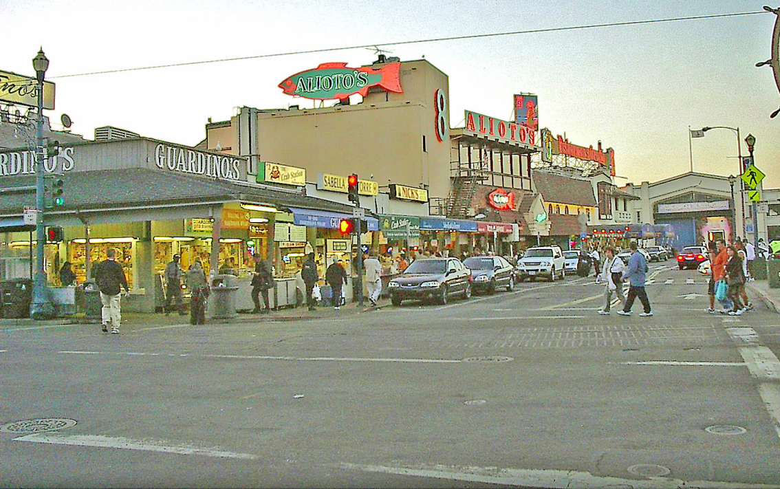
San Francisco - Fishermans Warf