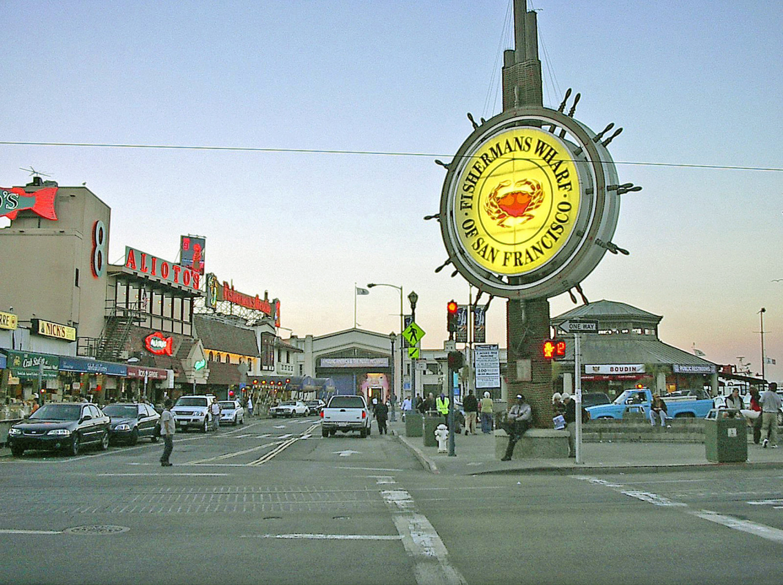
San Francisco - Fishermans Wharf