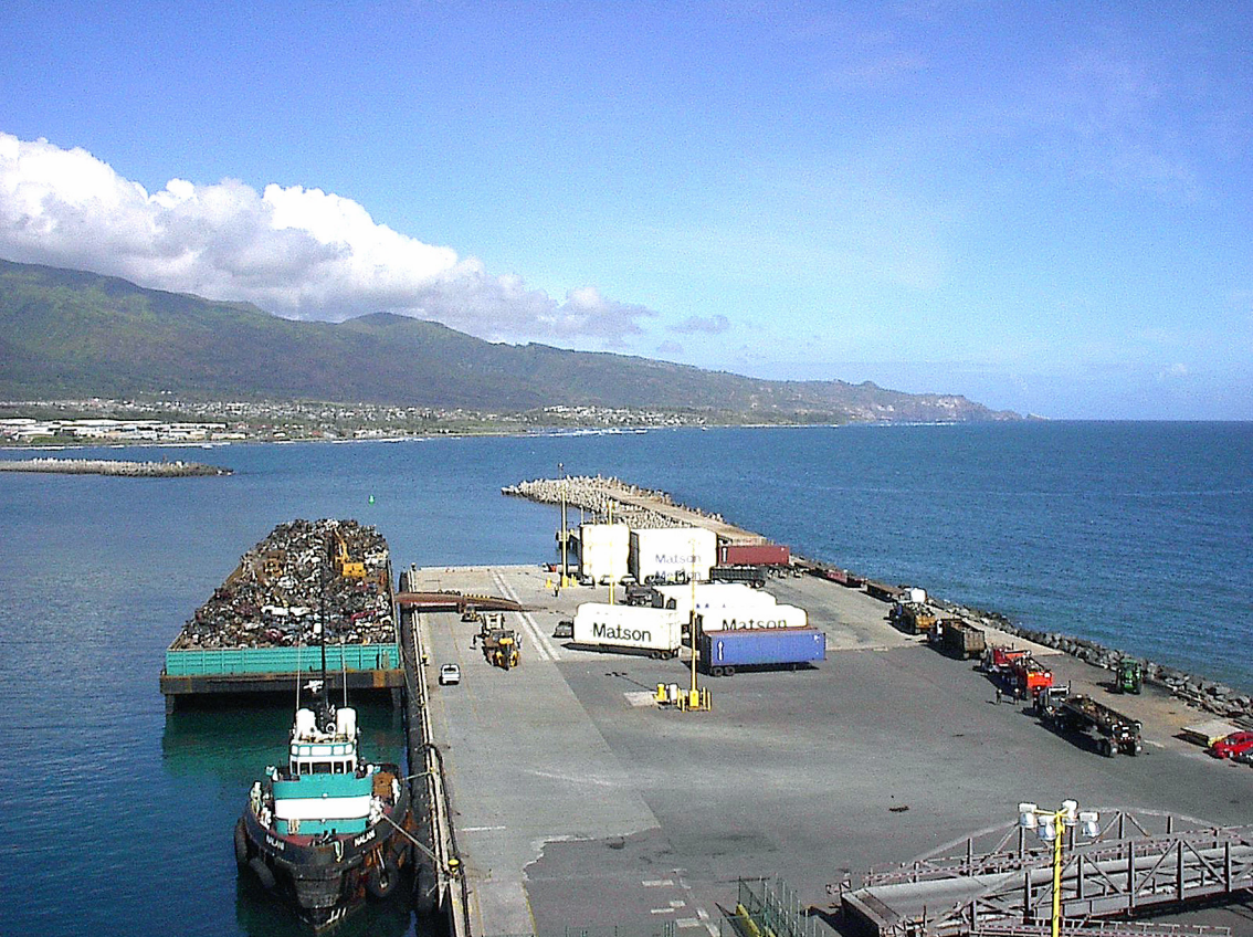
Maui - Hafen, hier wird Schrott, viel Schrott verladen