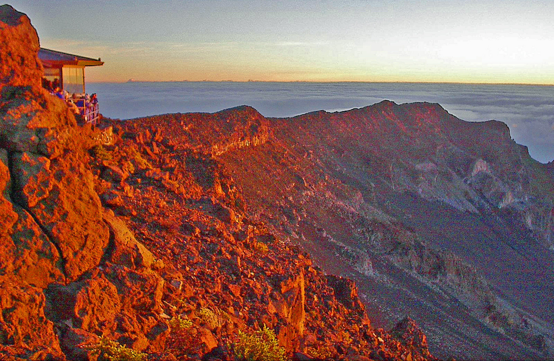
Maui - Haleakala Krater, Sonnenaufgang