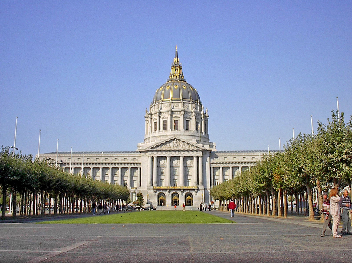
San Francisco - Rathaus