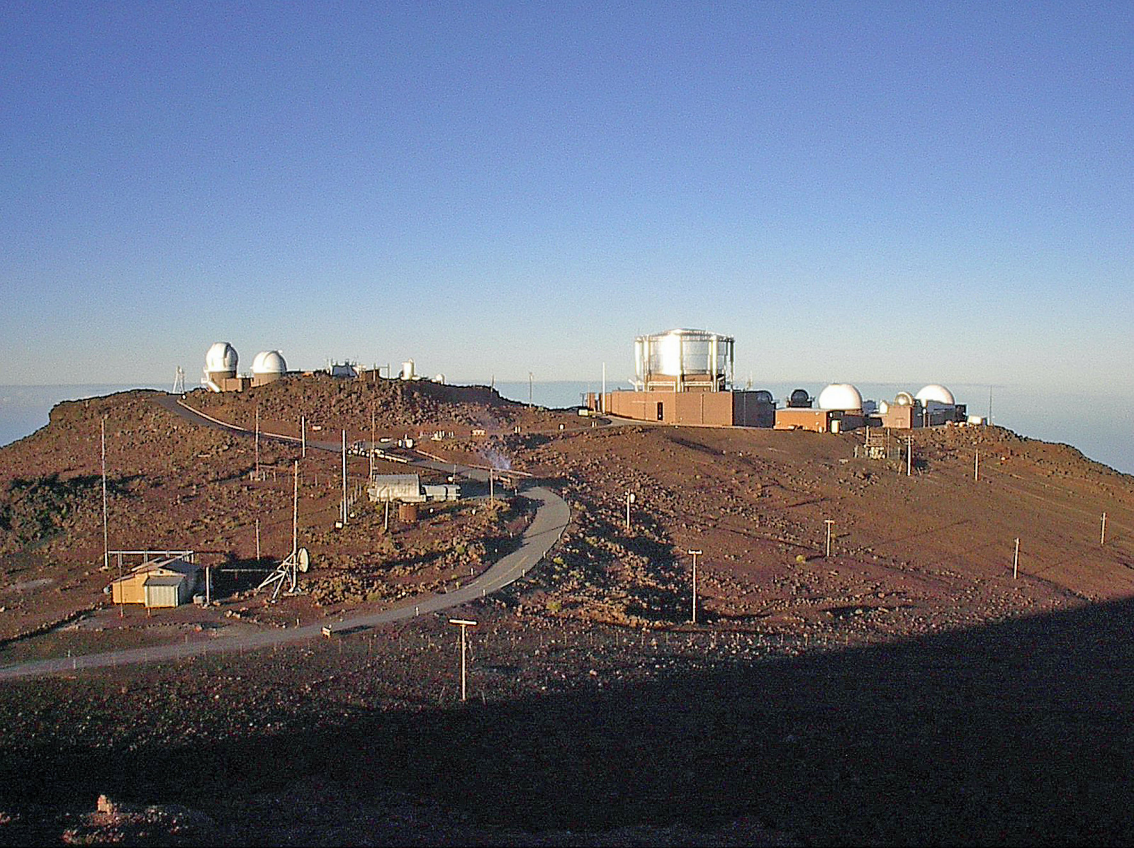
Maui - Observatorium